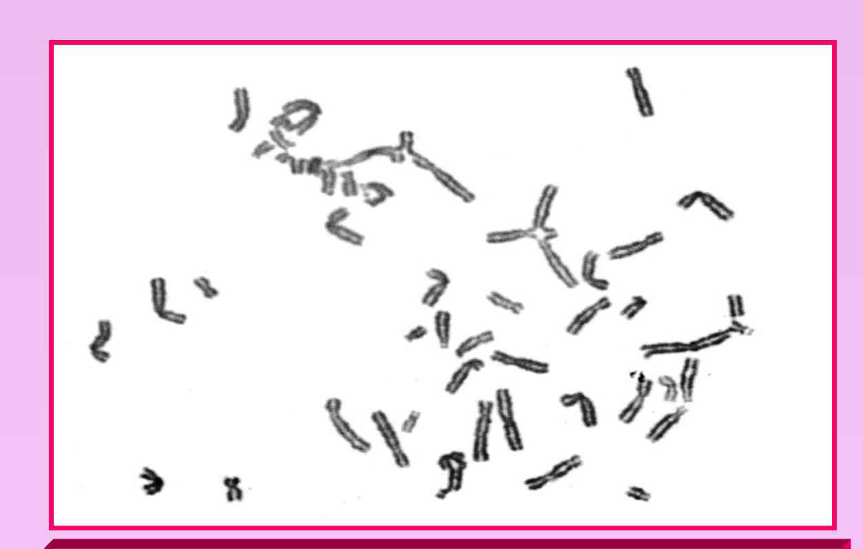
Figure 2: Metaphase spread from a FA patient, after exposure to MMC, exhibiting multiple chromosomal breaks and radial formations.

DNA from the 7 patients were subsequently tested for deletions of the FANCA gene. Molecular analysis showed that 5/7 belonged to the FA A subtype. Two were dizygotic twins, compound heterozygous for the same deletions (Figure 3). 16 family members were tested for carrier detection and 6 were identified as heterozygous for deletions of the FANCA gene.