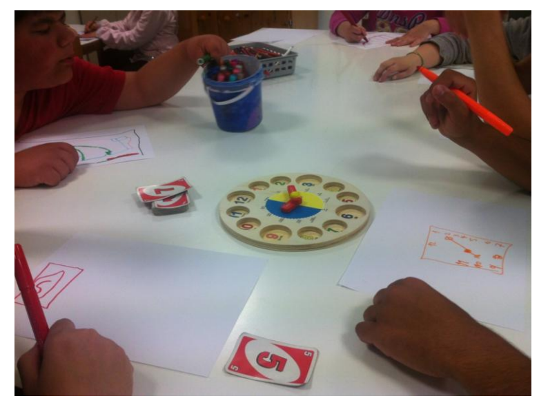
Figure 2: Co-design Workshop, creating physical game assets

In the last two months of the research, students would form a large group by active TA and TB students, who decided to form sub groups and design a location based game. This co-creative process was facilitated by researchers as part of the initial study and included design of analogue and digital assets, using drawings and then digitalizing them, location based games design and forming of a playful narrative. As Bowen describes, "the most engaging work allows for creativity, sparks curiosity, provides an opportunity to work with others, and produces a feeling of success" (2003).