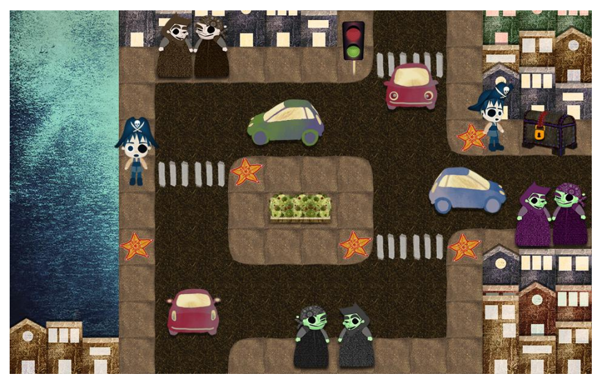
Figure 1: Street Pirates, an educational platform game for route training and street safety