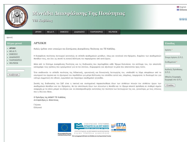
Figure 2. MODIP Website.