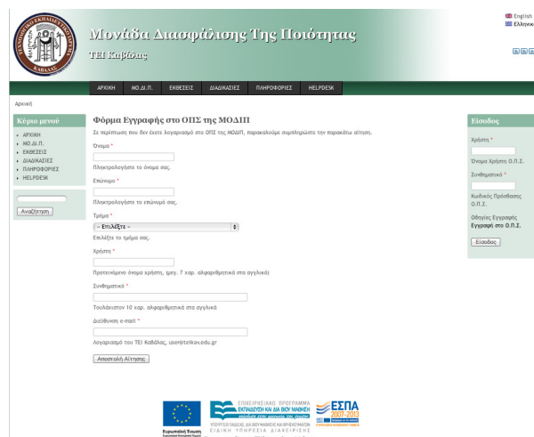
Figure 4. Integrated Information System of MODIP